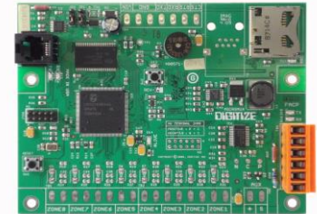
Optional MMX Addressable FACP interface