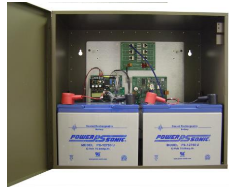
Digitize MeshSentry II Radio Network – PoE Power Supply / Charger Shown with Door Open and Batteries Installed