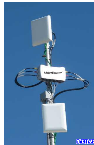
MeshSentry II ™ Network Antennas (Sold Separately)