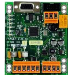
Optional TCU-8 Controller Can expand to 99 Remote Inputs and or Outputs IDMs