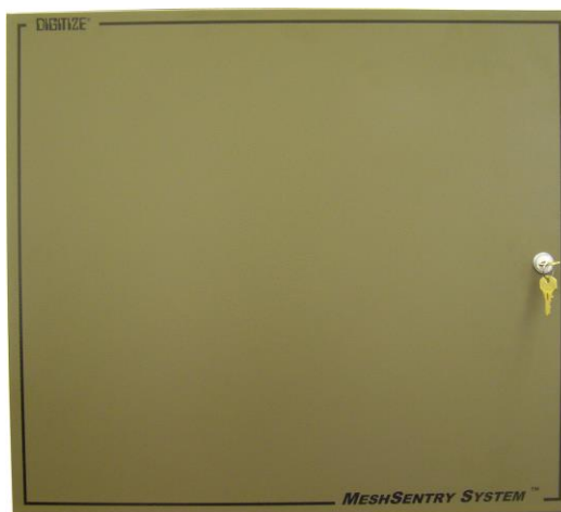
MeshSentry II ™ Radio Network – PoE Power Supply / Charger MeshSentry ™ and Battery Enclosure