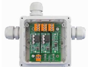
Optional SNP-3 accommodates Up to three SNP EOL or RLY IDMs