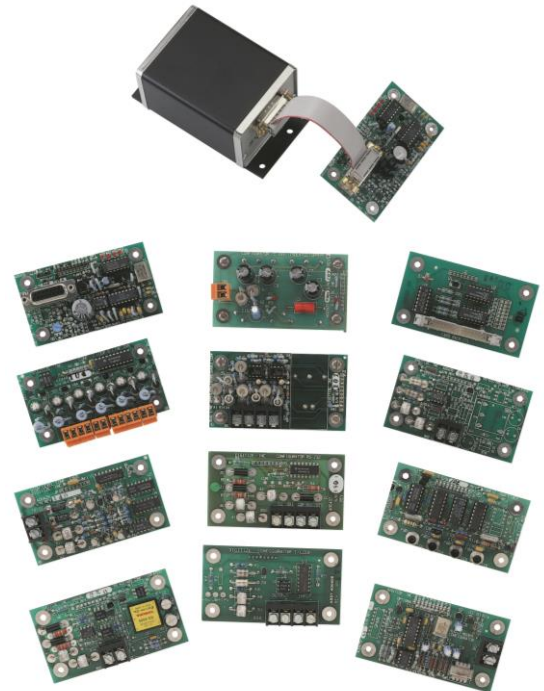
Typical Configurator Cards

NOTE: Stand-alone configurator cards do not include mounting hardware. Hardware must be ordered separately. Please refer to P/N 450550-0001 when ordering.