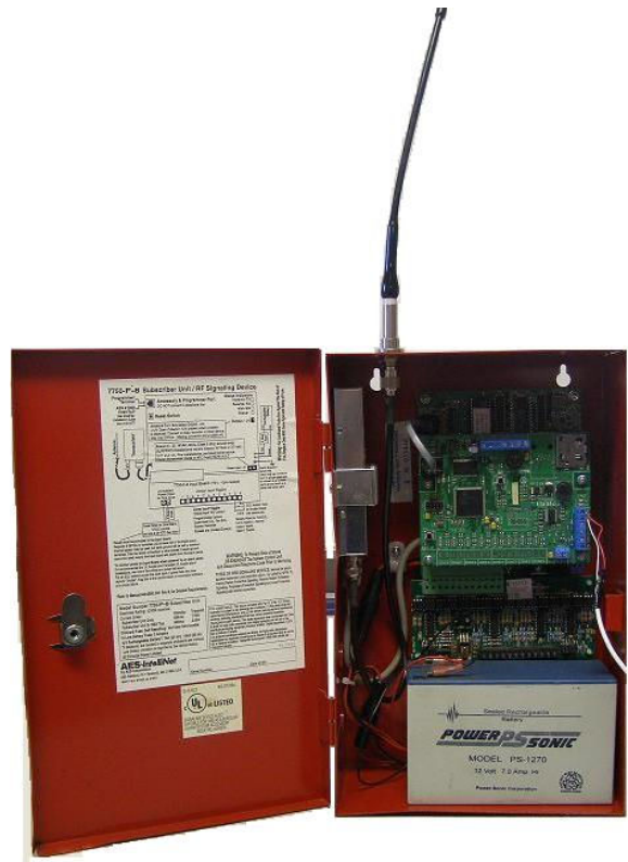
An Intellitize Subscriber Unit with MMX Installed

Simplex-Grinnell 4100, 4100U, 4020 & 4120