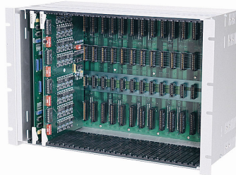
RPI-32RM Card Shown Installed in a 512 Zone Card Rack

The RPI-32RM requires the purchase and installation of the Direct Wire Option (P/N 010001-0055) and the 512 Zone Card Rack (P/N 450517-0001). The Direct Wire Option will provide direct wire capability of up to 512 zones. Each additional 512 zone capacity requires another option (P/N 010001/0055).