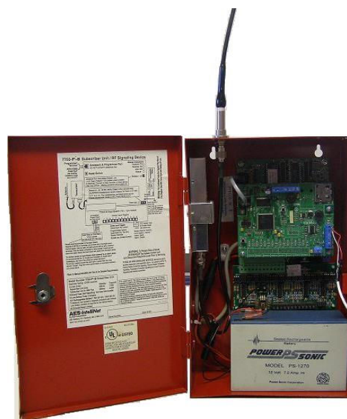
An Intellitize Subscriber Unit with MMX Installed