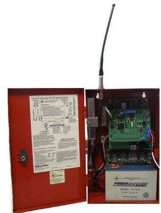
An Intellitize Subscriber Unit w/ MMX Installed

The MMX capability allows the ISU Unit to be connected to addressable Control Panels and process all of the panels' Alarms (Fire & Burglar), Supervisory, Trouble and restore conditions via the Intellitize radio system to the SYSTEM 3505 as an ancillary device. The precise English text displayed on the FACP is sent to the SYSTEM 3505 with the alarm activation. The SYSTEM 3505 supervises the MMX card and presents a daily test report from the Subscriber Units that do not report in after the test. The MMX card supervises its connection to the FACP. If the SYSTEM 3505 is taken OFF line, all of the Alarm information, including the FACP text, is held in memory until it can be retrieved by the SYSTEM 3505 when it is placed ON line. The MMX can be interfaced to a variety of FACPs in Standalone or Networked configurations.